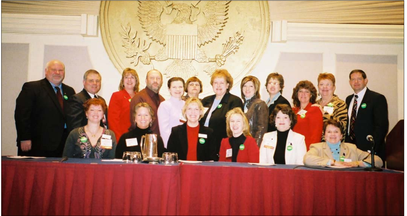
The Missouri ACTE delegation to the National Policy Seminar take a break to mark the moment.