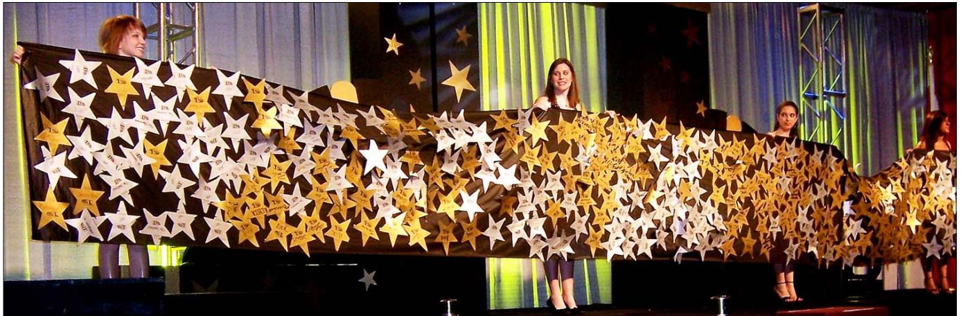
Missouri DECA State Officers hold up the "Wall of Fame" during the closing ceremony which represents contributions to MDA from members at the State CDC.

Missouri DECA chapters are "Leading the Way for MDA" after the 2006-2007 campaign that benefits the Muscular Dystrophy Association (MDA). Missouri DECA chapters raised a combined total of more than $50,000 this school year.